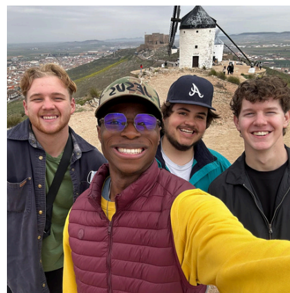
Semesters (Fall & Spring), Summers (Two Terms) & Service-Learning.