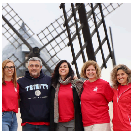
Classes taught by Sevillian professors & homestays with Spanish families.