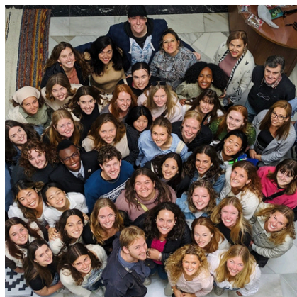
Intercultural Engagement, Immersive Scholarship, & Inclusive Christian Community.