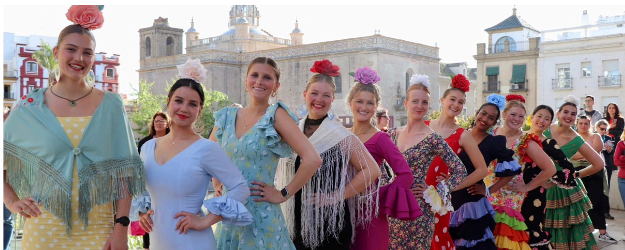
Immersive Spanish language program in Sevilla, España