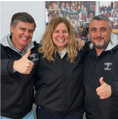
Classes taught by Sevillian professors and homestays with Spanish families