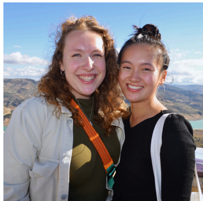
Intercultural Engagement, Immersive Scholarship, & Inclusive Christian Community