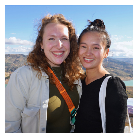
Intercultural Engagement, Immersive Scholarship, & Inclusive Christian Community