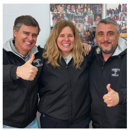
Classes taught by Sevillian professors & homestays with Spanish families