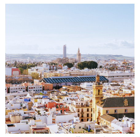
Semesters (Fall & Spring) Summers (Two Terms) Internships & Service Learning