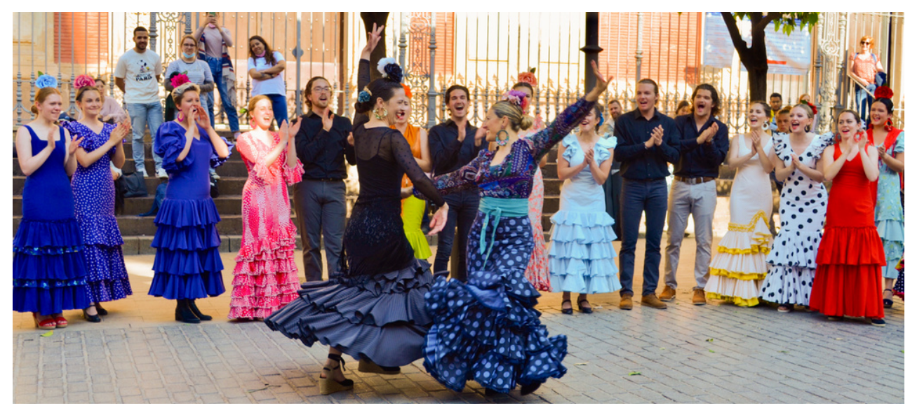
Immersive Spanish language program in Sevilla, Spain